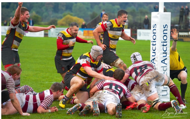
Celebrating the winning try